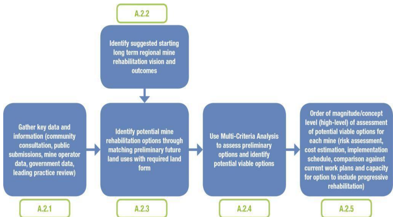
Figure 10-1 : Study Method

Figure below illustrates how each part of the study method informs the identification of a set of potentially viable final landform/mine rehabilitation options for each mine.