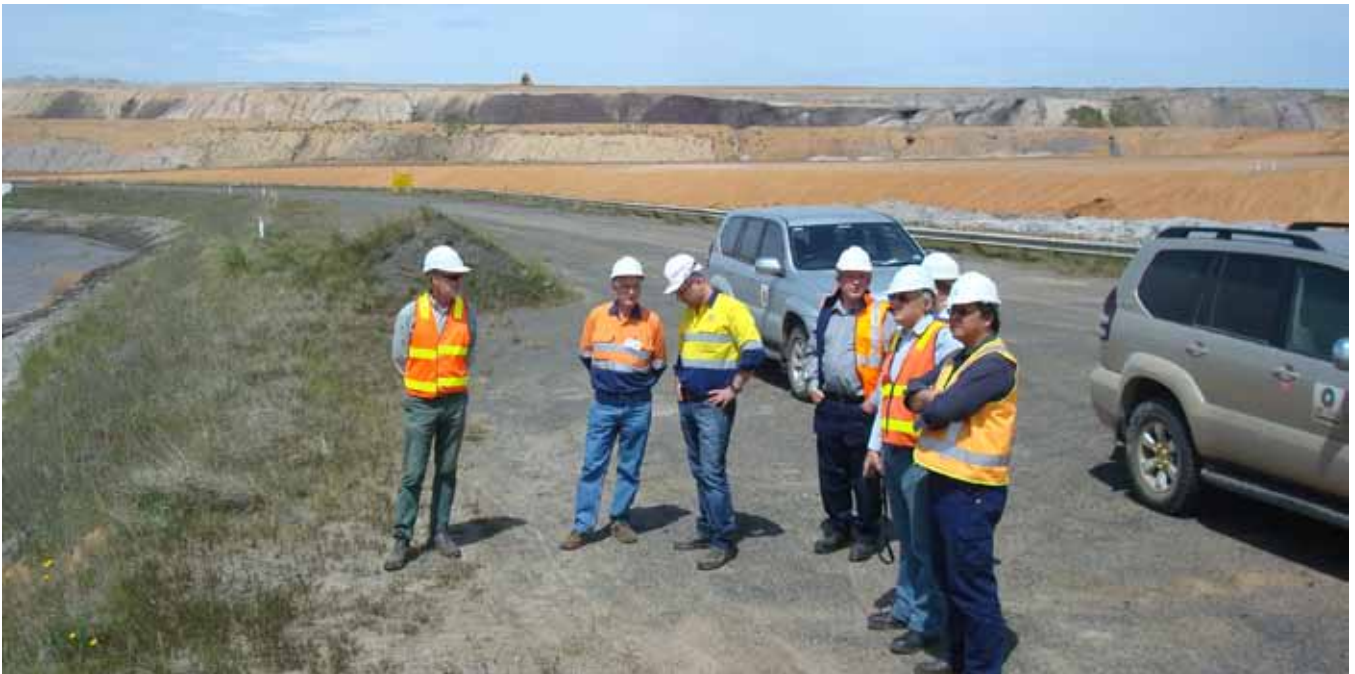
Loy Yang site visit