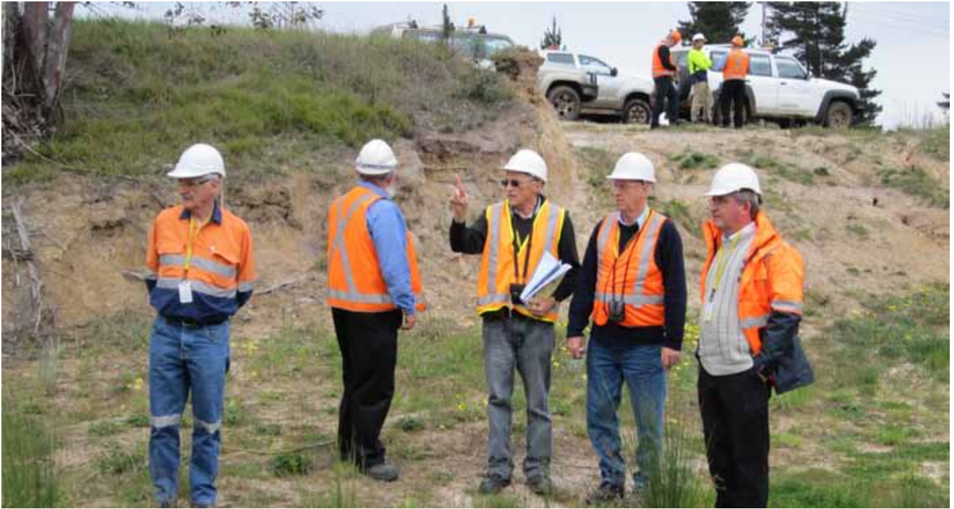
Hazelwood Mine site visit